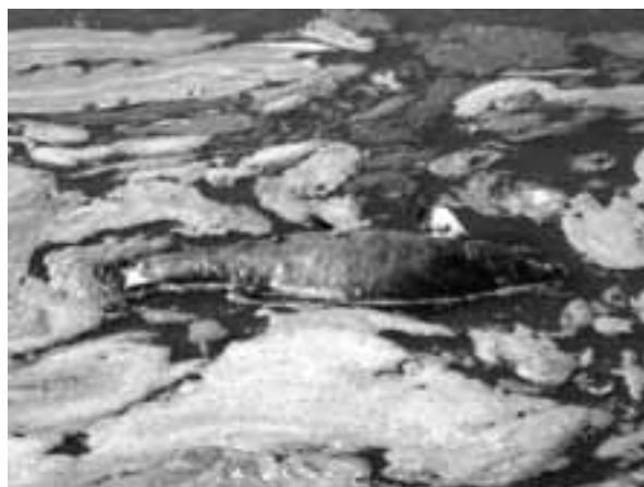
Dead fish floating in a eutrophicated lake

organic contamination. Instead, the decomposition processes caused by the aerobic bacteria produce toxins, such as hydrogen sulphide, ammonia or methane, and the stretch of water becomes polluted and “dies”. This in turn leads to the dying of fish. According to reports by the U.S. National Oceanographic and Atmospheric Administration (NOAA), eutrophication of this nature has caused mass mortality of marine animals in the Gulf of Mexico. Satellite pictures have revealed a similar phenomenon of colossal dimensions in the northern region of the Caspian Sea, to the east of the Volga Estuary. These zones are then referred to as “dead zones” because hardly any marine creatures can survive there.