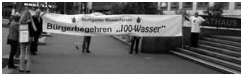
Activists from the Stuttgarter Wasserforum outside the Town Hall in Stuttgart with their “Citizens’ Petition 100-Wasser” banner calling for the 100 per-cent remunicipalisation of the city’s water supply

The conflict of interests, into which the mayor has manoeuvred himself, is clearly visible from these statements. He sees himself first and foremost as being answerable to EnBW’s desire for discretion, in others words to the purchaser, and not to the legitimate interests of the citizens who elected him into office and who pay his salary – and whom he is duty bound to serve on account of his oath of office. Another fact weighing equally heavily is: these assets were built up and paid for by generations of taxpayers.