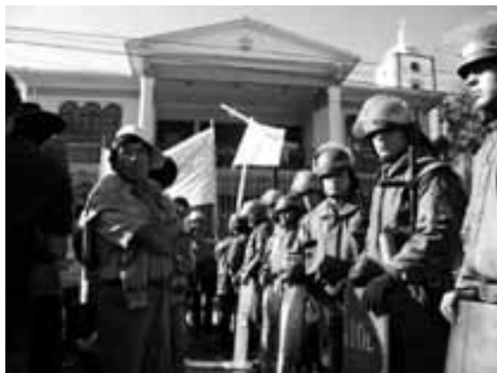
Water activists protesting outside the Town Hall in Tiquipaya, Bolivia

Corporate business policies triggered off equally strong indignation amongst those citizens who could not afford access to drinking water – although the necessary infrastructure was already in place in their part of the city – since Suez had raised connection fees from around US$100-120 previously to $445. In view of the fact that many people have less than one dollar a day to live on, this would have meant their paying out several months' wages just to be connected to the mains network.