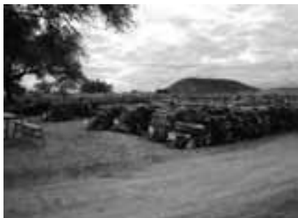
The aftermath of deforestation