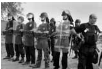
As construction work continues, policemen stand ready for action should the need arise