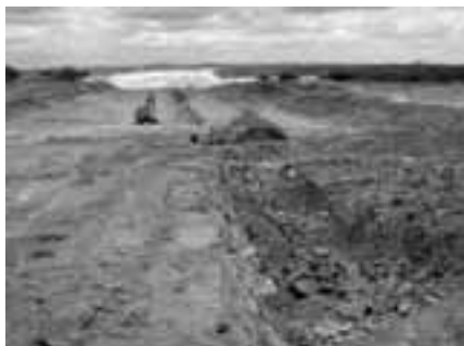
Excavators dig out a new river bed (2007)