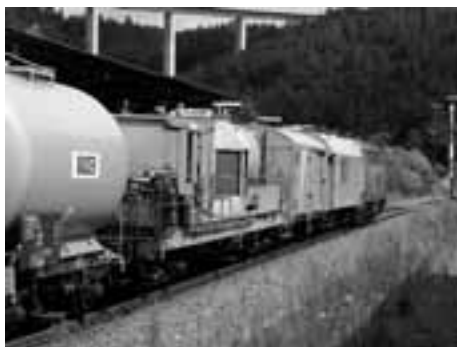
One of German Railways’ special trains spraying the track bed with herbicides

MTBE This abbreviation stands for methyl tertiary-butyl ether, a fuel additive used nowadays to increase the anti-knock quality of fuel, replacing the tetraethyl lead, which in the past transformed unleaded petrol into leaded. On account of its water solubility, this substance contaminates the ground water to a very considerable degree and it is practically impossible to eliminate it using conventional methods. Although MTBE was banned in California in 2003 for this very reason, decision-makers here in Europe have not yet started to take the matter seriously. It is alarming to think that over 20 million tons of MTBE are manufactured every year, making it one of the world’s most widely produced chemical compounds. The past has shown us that disastrous consequences often follow in the wake of the meteoric rise to fame of any given chemical substance before sufficient research has been conducted into its environmental impact. Here in Germany, the time has come to carry out extensive research into the effects of MTBE and to draw the necessary conclusions from the results.