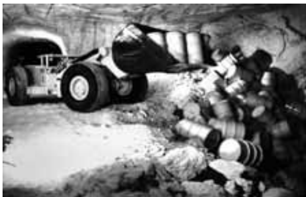
Barrels full of radioactive waste being unloaded in the Asse II salt mine

Brunswick against the Minister for the Environment, Hans-Heinrich Sander, on account of his illegal handling of radioactive substances. By doing so, they hope to enforce the closure of the mine under the Atomic Energy Act and also secure publicity of proceedings. This is only what the electorate would have expected of the Green Party fraction in the Bundestag, while it was still in power!