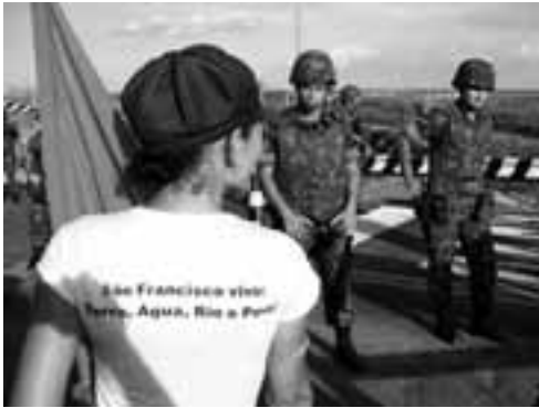
Protests in Sobradinho in December 2007