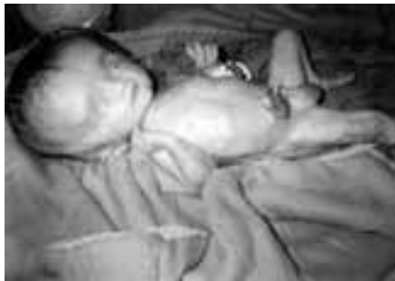
Babies born severely deformed, but still alive, in Afghanistan