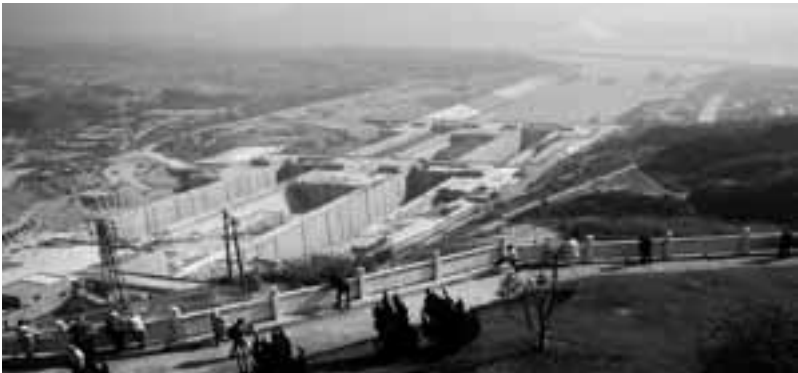
The Three Gorges Dam in China

Vast projects such as the Ilisu Dam in Turkey are only made possible through German export subsidies like the ones granted by the KfW bank, government export credit guarantees or contracts of suretyship with other nations. This is why protests against these large dam-building schemes must be mobilised even further at international level. In India, work is being carried out on the Narmada Dam system, which is one of the world's largest water-related construction projects. The centrepiece is the Sardor-Sarovar Dam, against which the inhabitants of more than 245 villages, due to be inundated, are putting up fierce resistance.