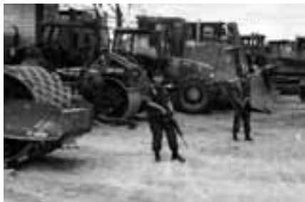
Construction machinery and equipment under military protection