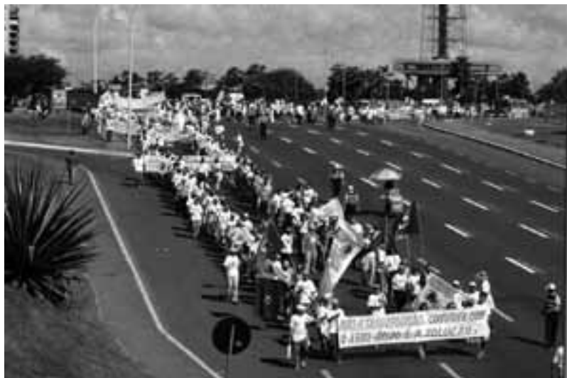
Protestors in Brasilia in March 2007