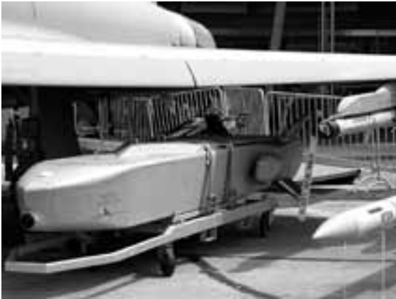
A Taurus KEPD 350 cruise missile under the wing of a Eurofighter Typhoon jet plane, but not mounted to it

to its destination. Every single one of the 600 Taurus cruise missiles which were manufactured for Germany contains about a quarter of a ton of uranium.