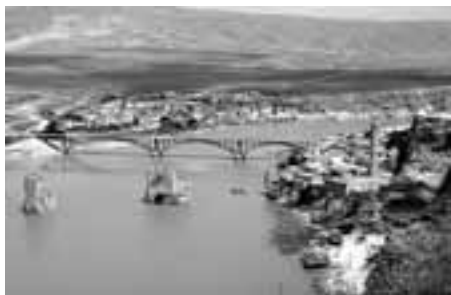
The proposed site of the Ilisu Dam and the town of Hasankeyf

credit insurance, even though the amount of borrowing itself would be comparatively low as a result of these salami tactics.