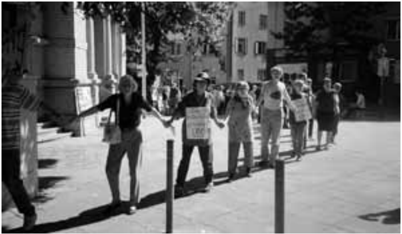
A protective human chain encircles the Bismarck School in Stuttgart Feuerbach. The city council had planned to sell this school along with 26 others in Cross Border Leasing deals

It is possible that private enterprises, too, have long since discovered similar forms of “tax optimisation” and are causing hitherto unknown amounts of revenue losses through CBL deals. Critics suspect that banks such as the Deutsche Bank, various provincial state banks and Debis (DaimlerChrysler) are using highly complex constructions to write off investments in connection with CBL transactions, for example via “intermediate companies” in tax havens such as Bermuda or Barbados.