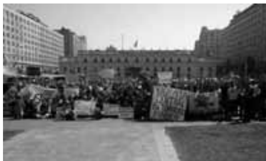
Demonstrators gather in front of Moneda Palace, Chile's seat of government, to protest against the proposed dams in Patagonia

www.patagoniasinrepresas.cl (Spanish and other languages)